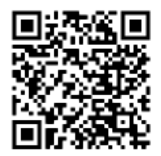
Instruction on How to Update Pin